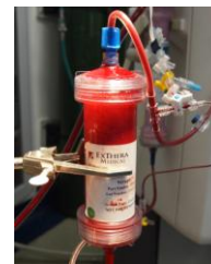
Figure 2. Seraph™ Microbind™ Affinity Blood Filter (ExThera Medical, Berkeley, CA) in series with a dialyzer during a large-animal safety study.

Conclusions: Bacterial removal by the anti-thrombogenic heparin media was much greater for MRSA, which binds to soluble heparin, relative to P. aeruginosa which does not. The (thrombogenic) control media also bound some MRSA non-specifically. A very long list of pathogens and toxins have been reported to bind to soluble heparin and heparan sulfate 1 . This indicates a.) the breadth of adsorbates that may be removed from whole blood by 'immobilized heparin affinity therapy' and b.) its potential utility as a clinical treatment for bacteremia, particularly when caused by drug-resistant organisms, or when no alternative treatments are available.